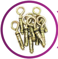
Rawl Hook Fastener