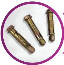
TAN Pipe Fastener