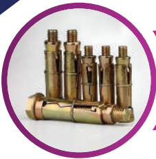
Rawl Bolt Fastener