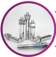
Ceiling Anchor Fastener